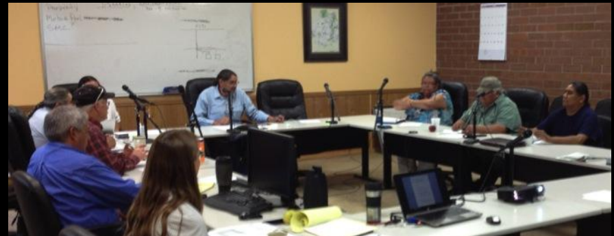
USRT Commission Meeting