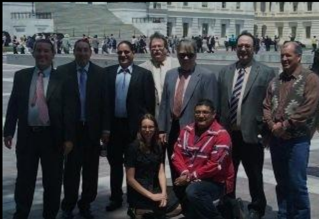
Photos: Columbia Basin tribal delegation in DC