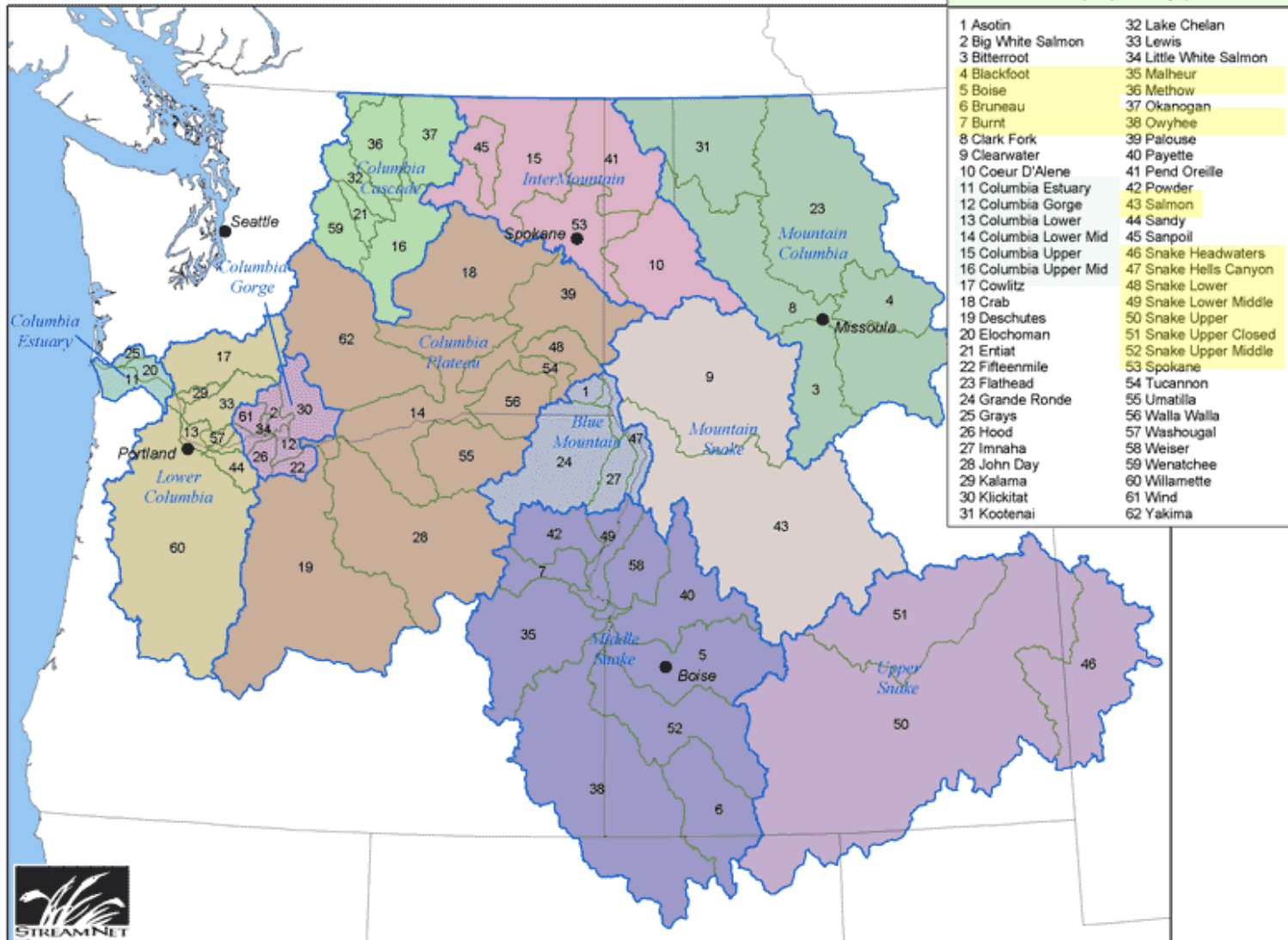
Columbia River Basin Subbasins