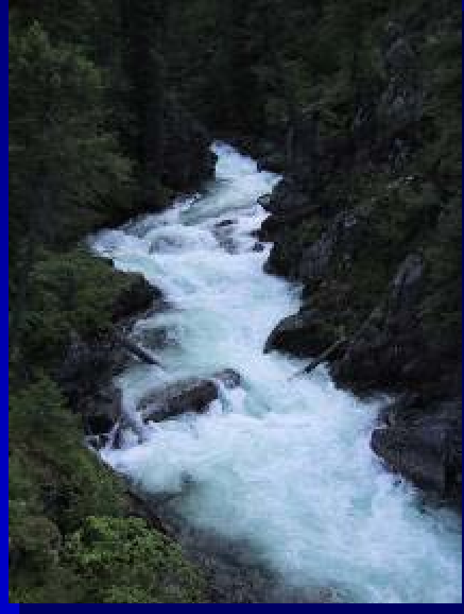
Lostine River, Oregon