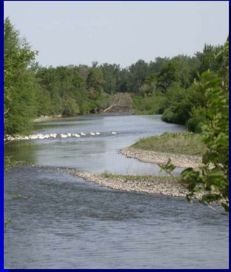
Umatilla River below WID