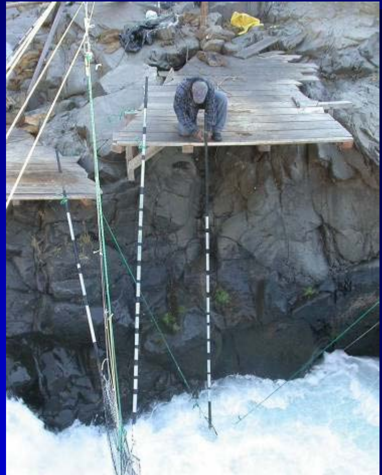
Fishing at Lyle Falls, Klickitat River

Programmatic issues such as subbasin plan use and improvement