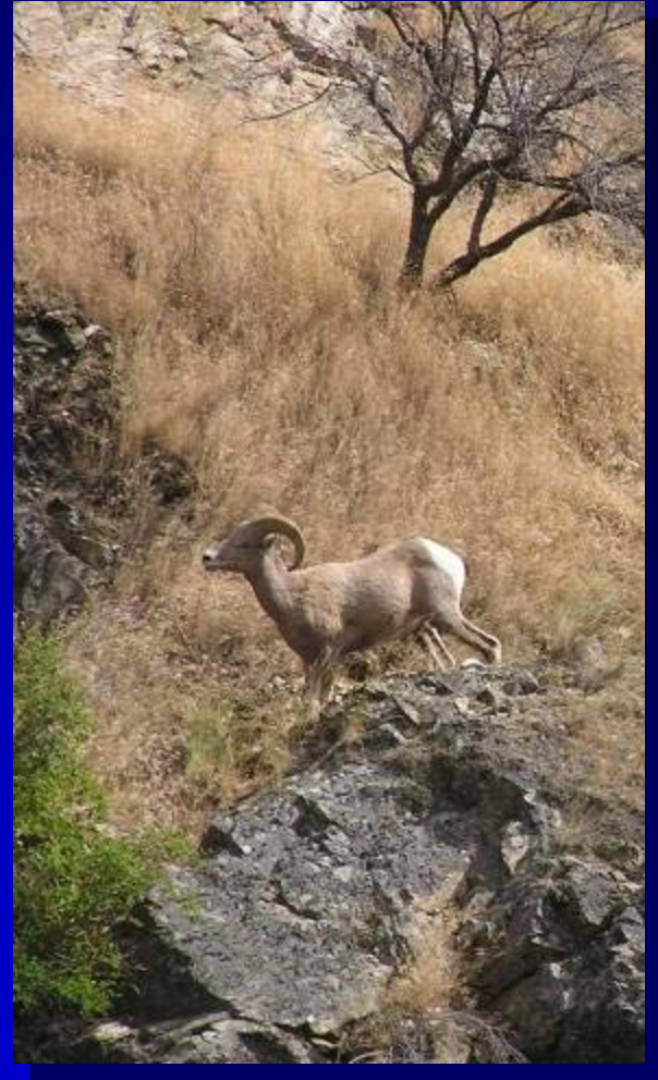
Bighorn Sheep, Middle Fork Salmon