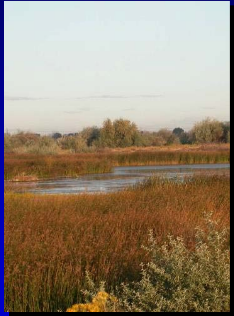
Wanaket Wildlife Management Area

Review synthesis reports from project proponents (LSRCP, SAFE, CSS, Umatilla) – preferred approach