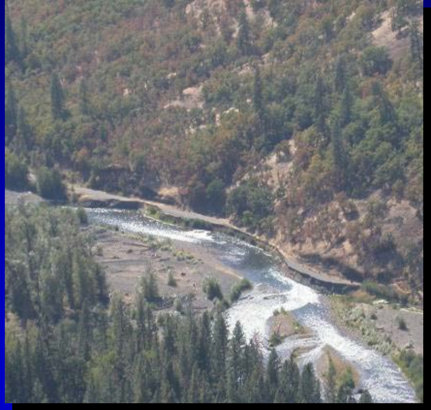
Klickitat River, Washington