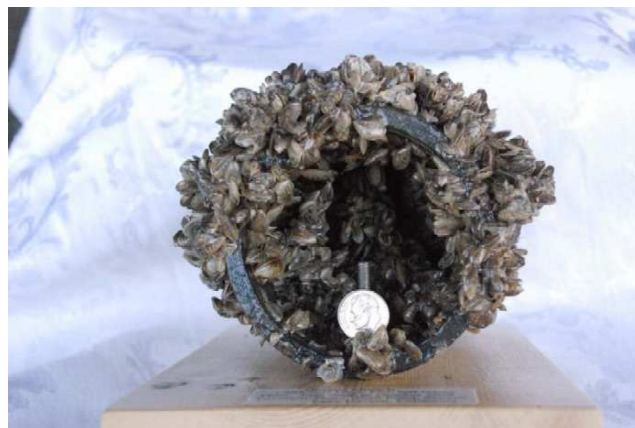
Pipe encrusted with zebra mussels.

A dedicated rapid response fund is necessary to rapidly implement containment at state or federal waters newly infested with quagga and/or zebra mussels. This fund would help States and other jurisdictions organize and begin implementing immediate actions while they work with