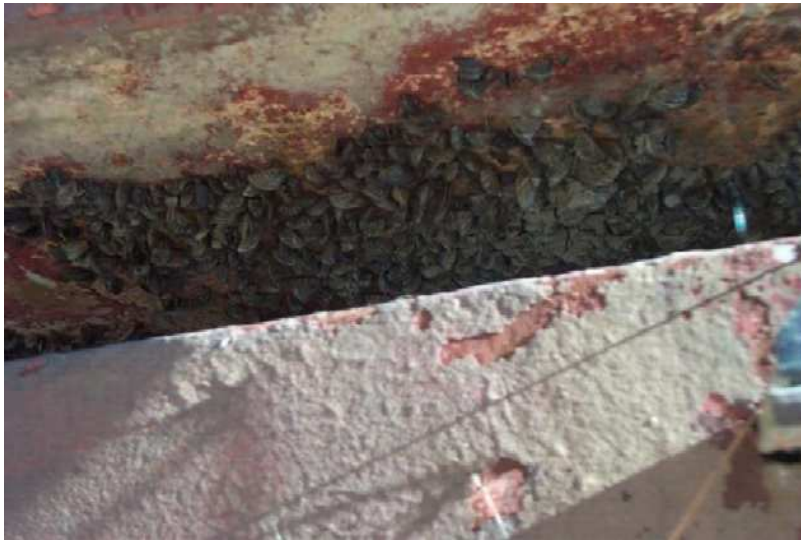
Zebra mussels on a trailered boat (view under the trim tab) intercepted while entering California in 2002.

For more expansive Dreissenid Biology and Background, please see Appendix C.