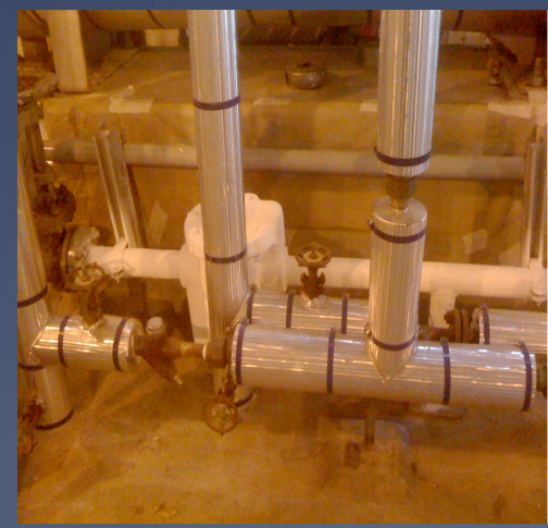
Steam Lines, Everywhere