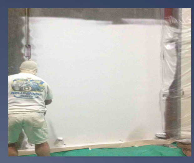
Cold Wall Condensation Control, Stemilt Packing