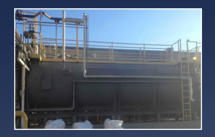
Del Monte Foods, Hanford