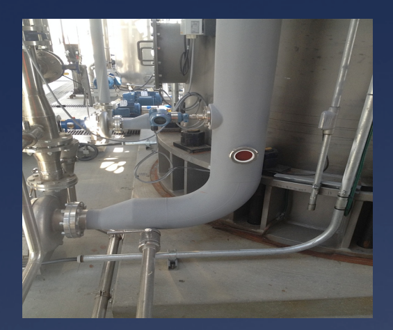
Hot Product Line, Ingomar Packing