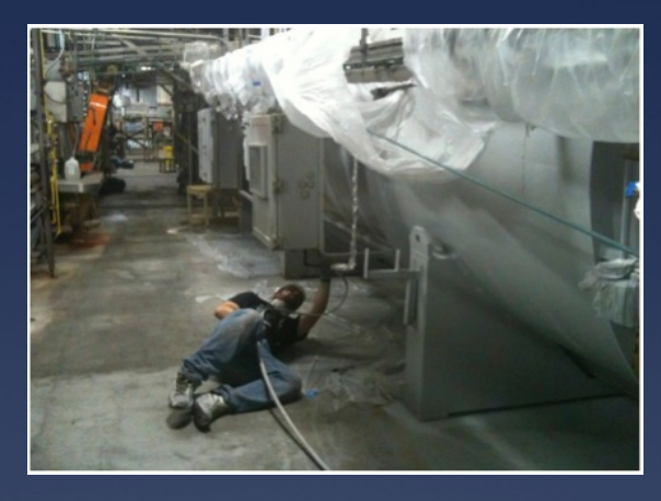
Independent Foods, Yakima